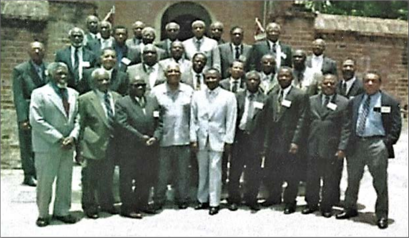
Class of 1963 60 th Anniversary